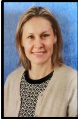
Early Years Leader and Class teacher