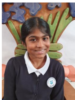
Athisaya Head Girl

Our elected Head Boy and Girl team for this year are: